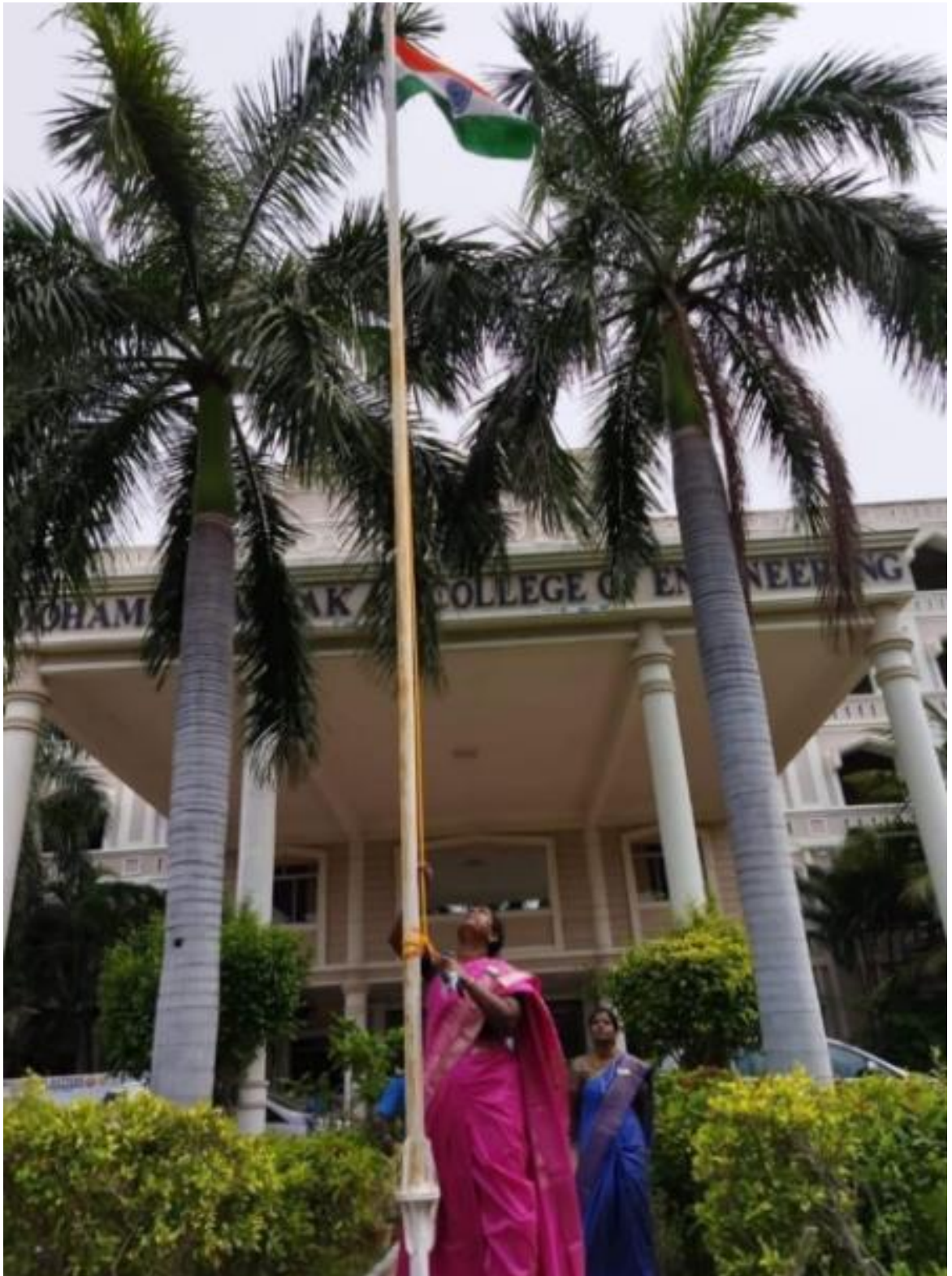
Flag Hoisting On Republic Day