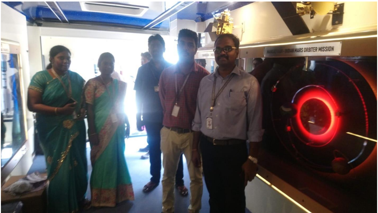
ISRO Vehicle Visit-Event ON 23/02/2021