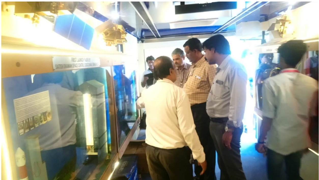
ISRO Vehicle Visit-Event ON 23/02/2021