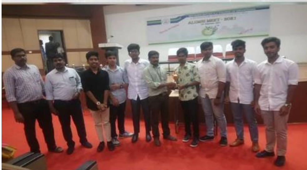
Runners in Republic Day Cricket Tournament