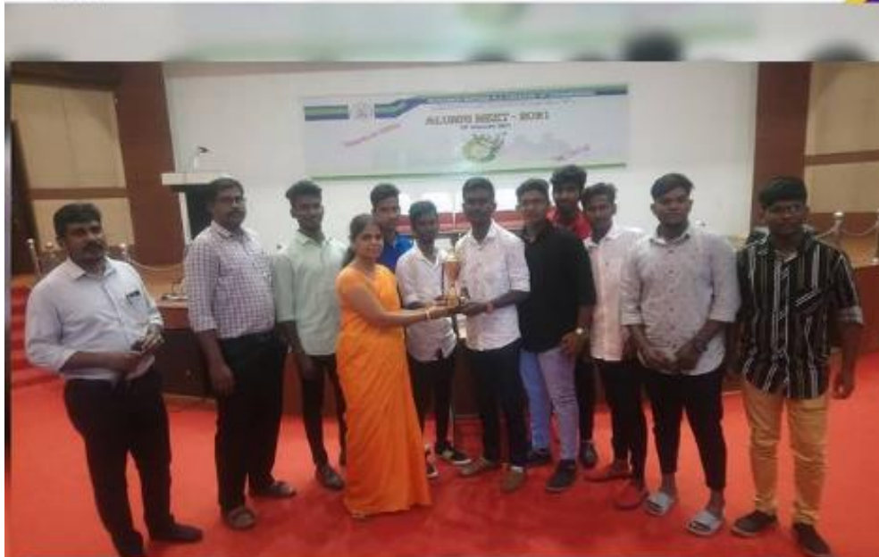
Winners of Republic Day Cricket Tournament