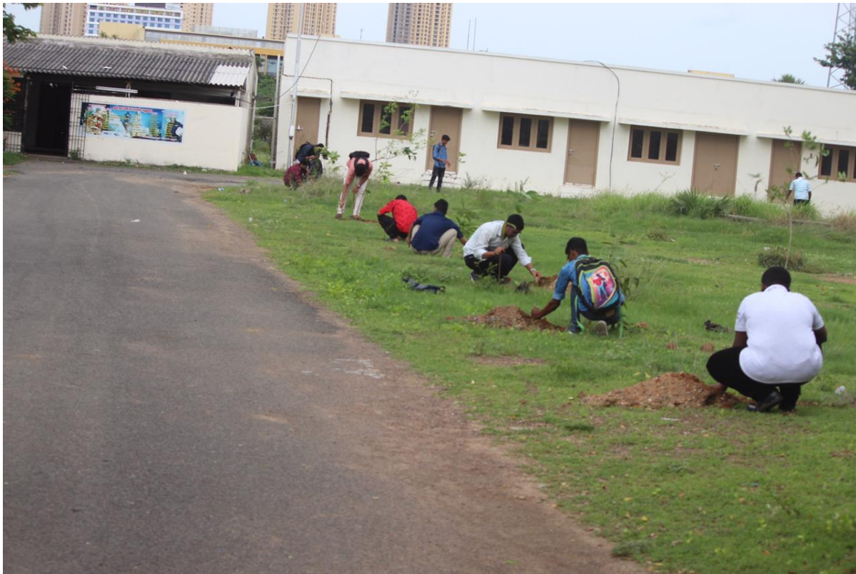
Tree Plantation on 05.8.2019