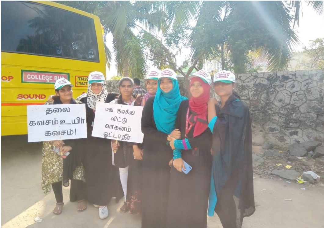
Road Safety Awareness Programme On 09.02.2019