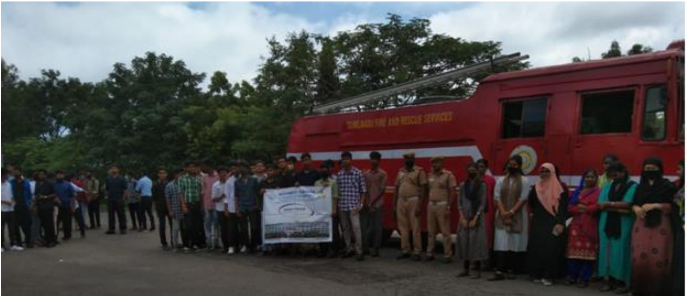
Fire Safety Awareness Program on 1/02/2021

Ensure Fire Safety, Save Life, Save Property. Fire can kill, don't be a statistic. Fire Defense Is A Self Defense. Fire Destruction Is One Man's Job, Fire Prevention Is Everybody's Job. As of above quotes we conducted fire safety awareness in our college on 1/02/2021 with collaboration of Fire Service Station, Siruseri,IT Park. They conducted a demo on safety measures and precautions, how to protect us from fire in our social environment.