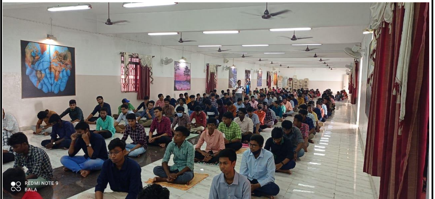
Yoga Day Photos –Pic 2