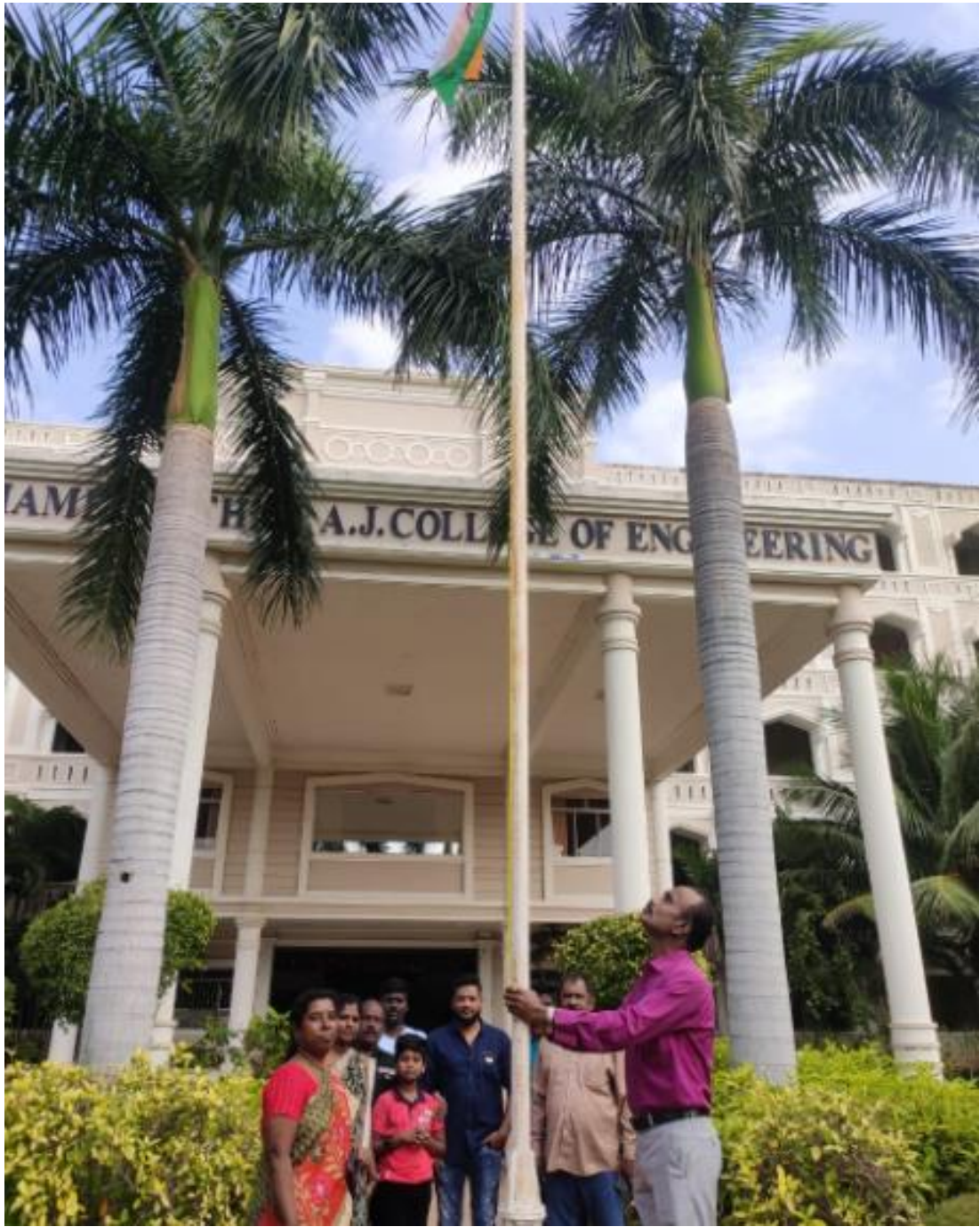
Flag Hoisting On Independence Day