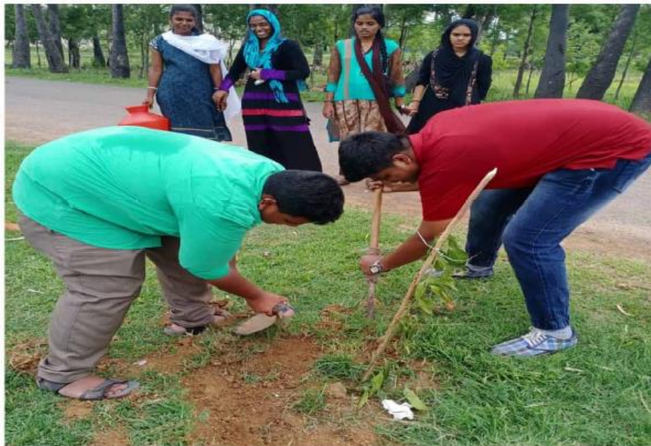
Tree Plantation Program on 30/08/2019