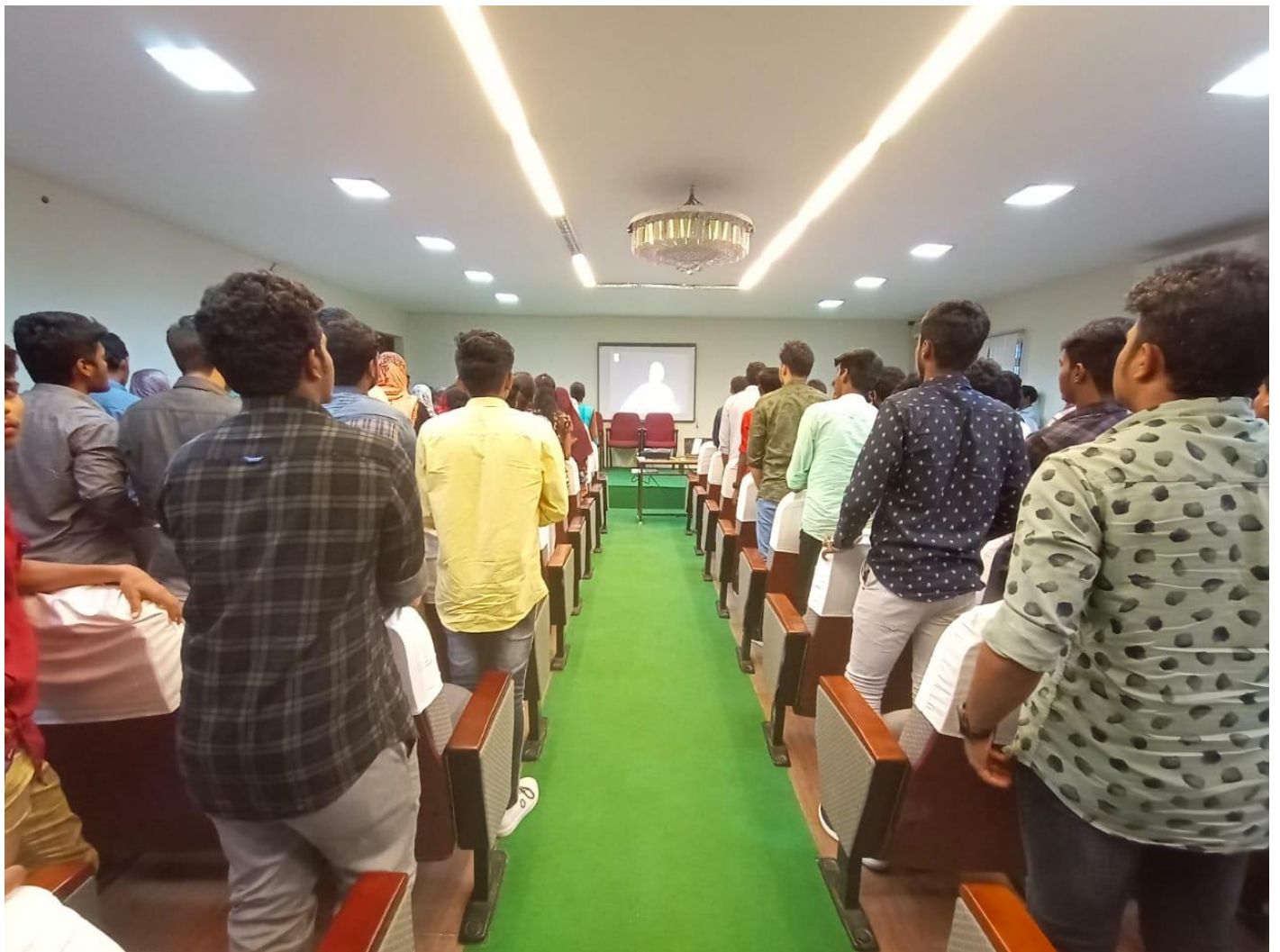
FIT INDIA PROGRAM ON 29.08.2019