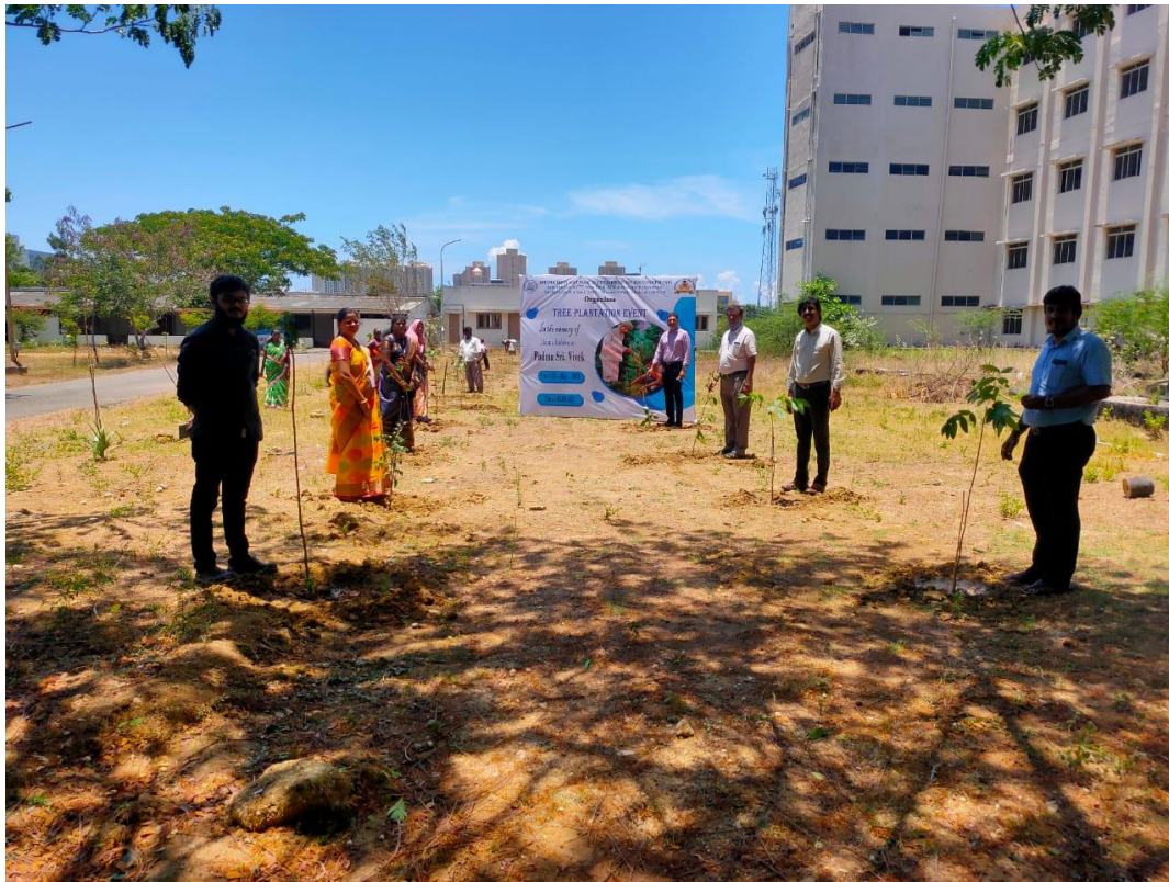
Tree Plantation Program on 03/05/2021